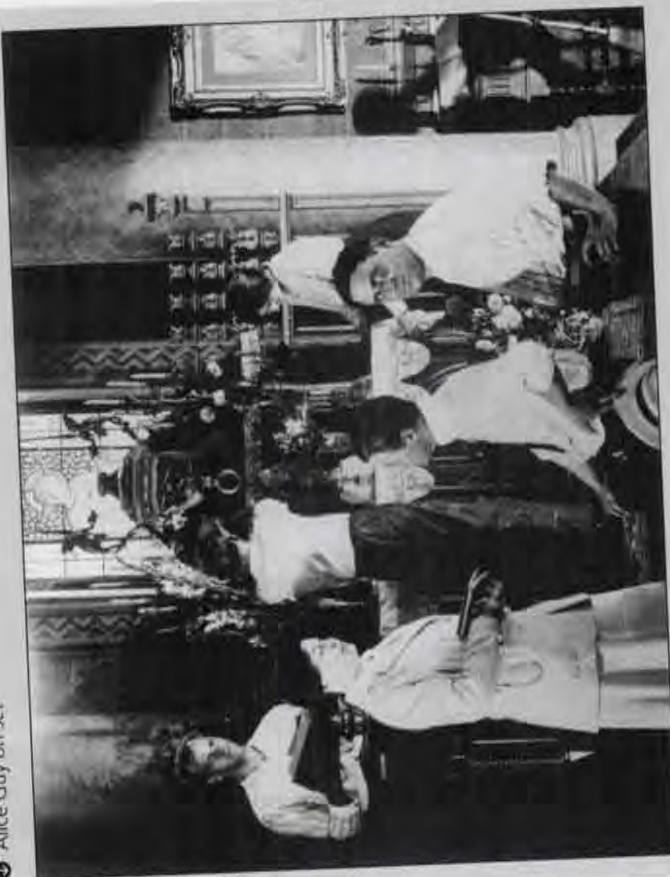
◆ Alice Guy on set